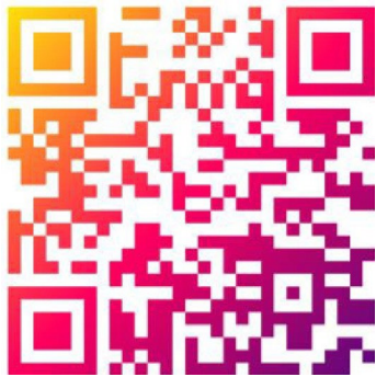
Kiki's Play-Along Pals