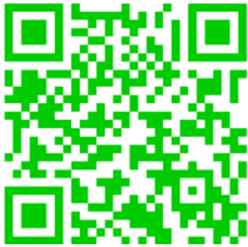
How to build and Kiki bundle