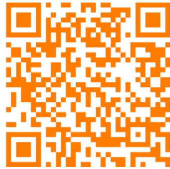
How to Build an Orff Ensemble