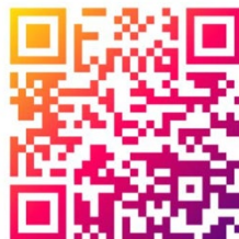
Kiki's Play-Along Pals