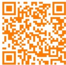
How to Build an Orff Ensemble