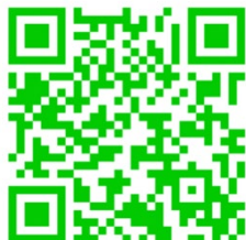
How to build and Kiki bundle